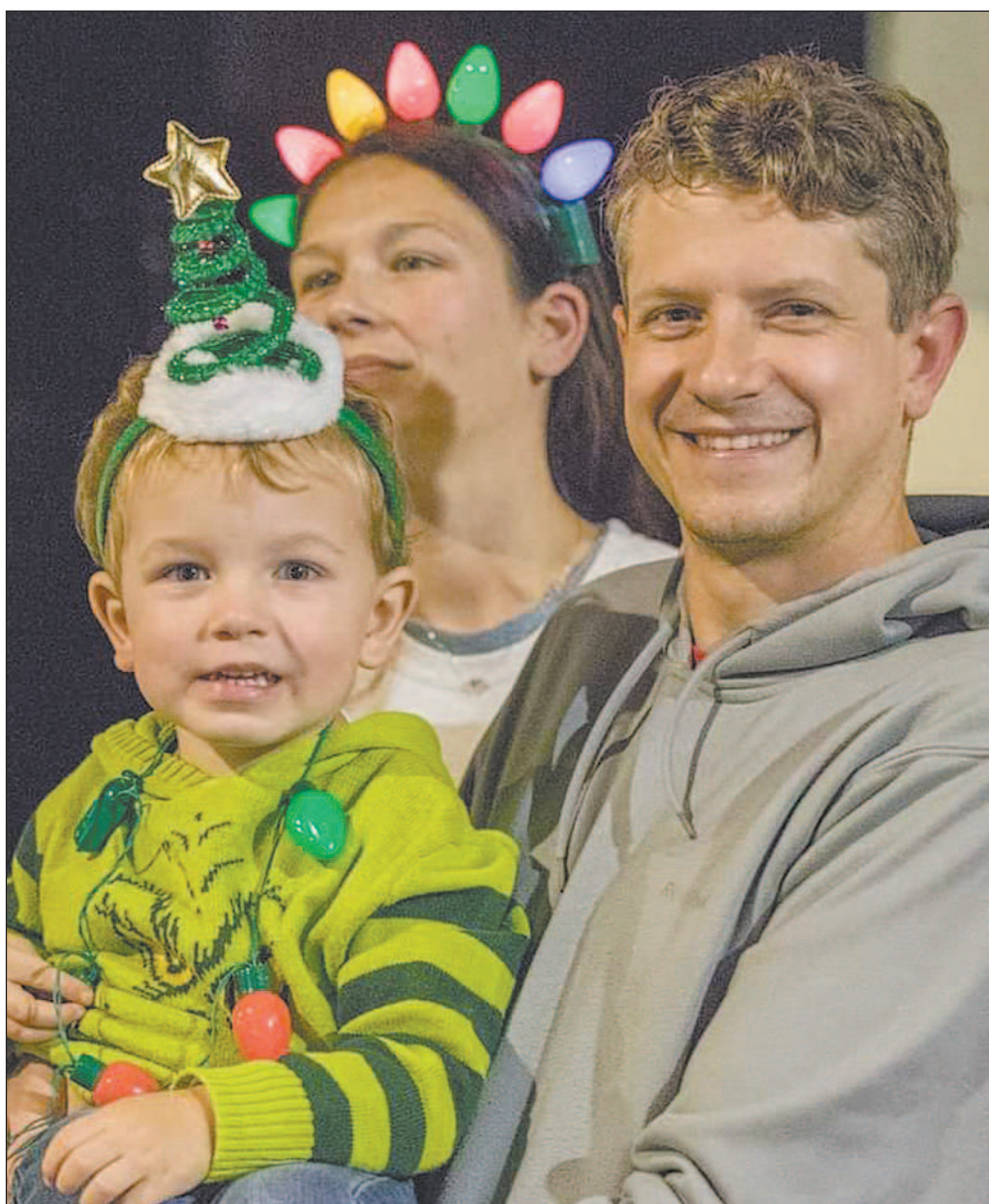
Loganville hosted its annual Christmas parade and tree lightning Saturday evening. The event once again drew a large crowd as old and young alike count down the days until Christmas.